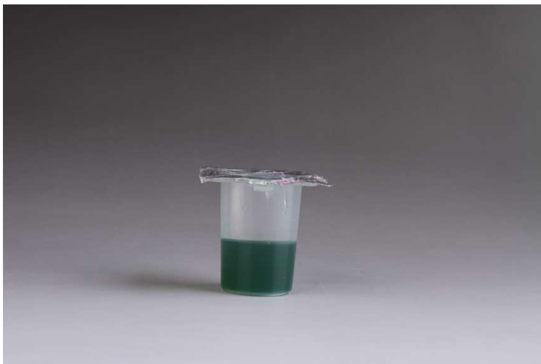
Blue - coliforms positive