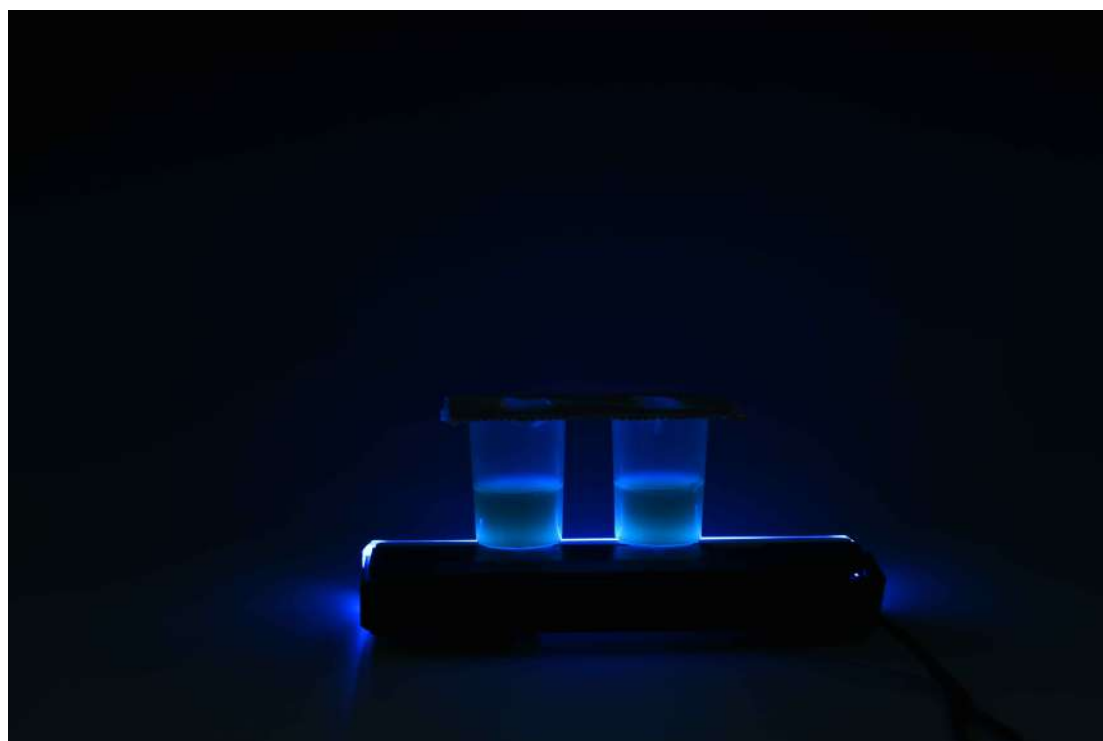
Fluorescence--E. coli positive