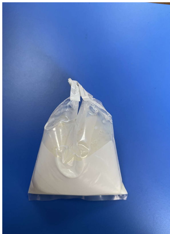
A type sampling-finished effect