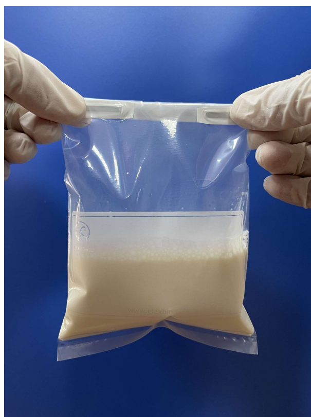
Step 6 Finished