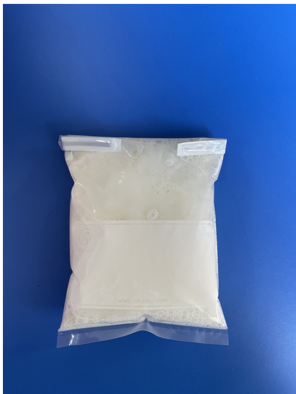
B type sampling-finished effect