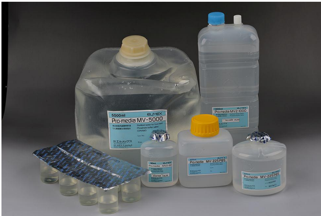
Sterile Diluent MT•MV Series